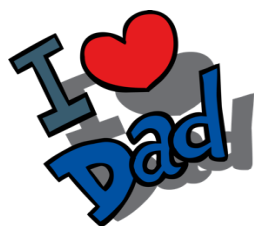
This Photo by Un-

STOPline Service. STOPline is an external service provided for the Archdiocese to receive confidential disclosures.